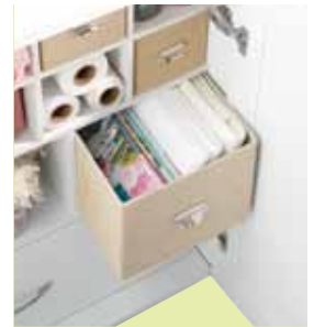
Small & Large Fabric Totes Sold Separately

Allows you to reach the back of the drawer