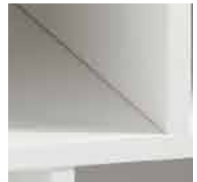
16" Deep Compartments