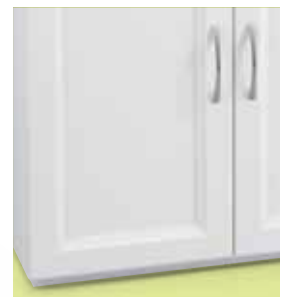
5-Panel Decorative Door Fronts