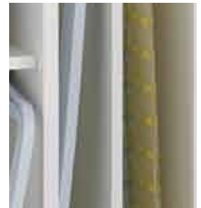
24" Mat and Hoop Storage