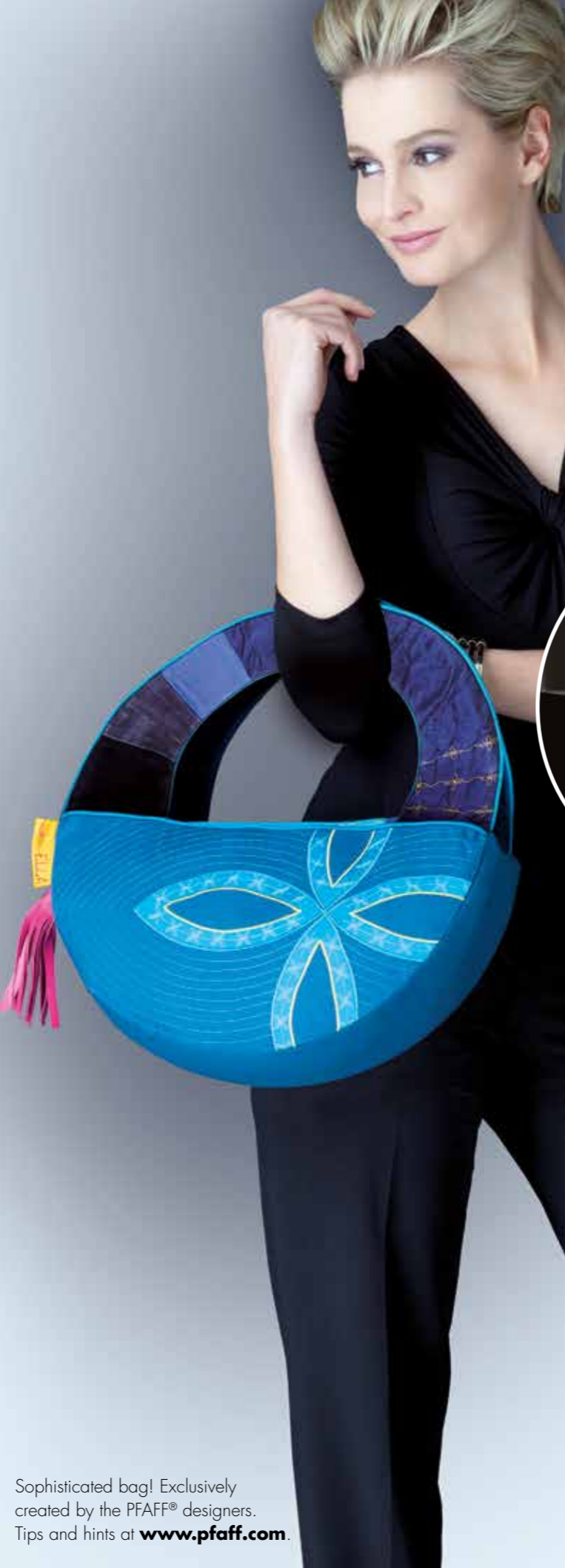
Sophisticated bag! Exclusively created by the PFAFF® designers. Tips and hints at www.pfaff.com .

Straight Stitch Needle Plate Sensor – Your PFAFF® performance™ 5.2 sewing machine alerts you if you try to select a stitch other than straight stitch when the straight stitch needle plate is attached.