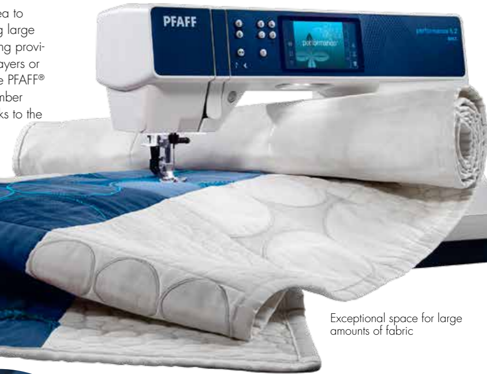
Exceptional space for large amounts of fabric

This and a lot more is all waiting for you.